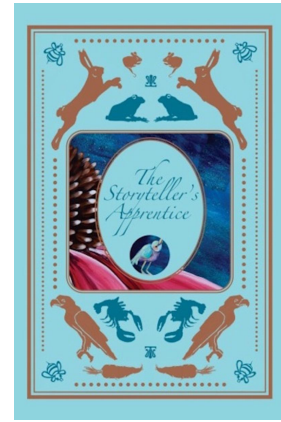
Jen Walls .

Jen Walls published another wonderful, magical book - "The Storyteller's Apprentice". Reserve a copy at www.thestorytellersapprentice.com/shop .